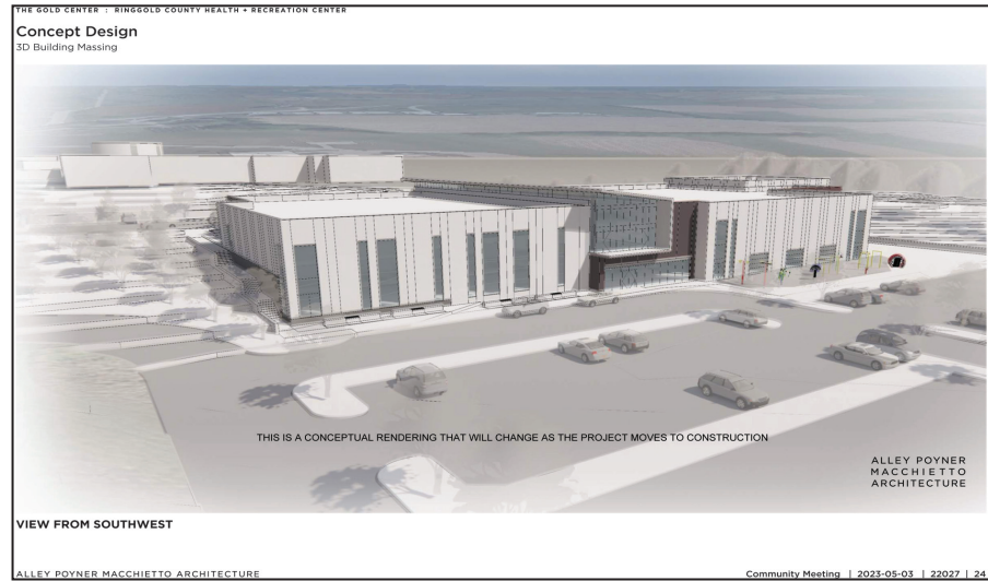
A preliminary design and 3D building massing by Alley Poyner Macchietto Architecture shows a view of the Gold Center concept from the Southwest.